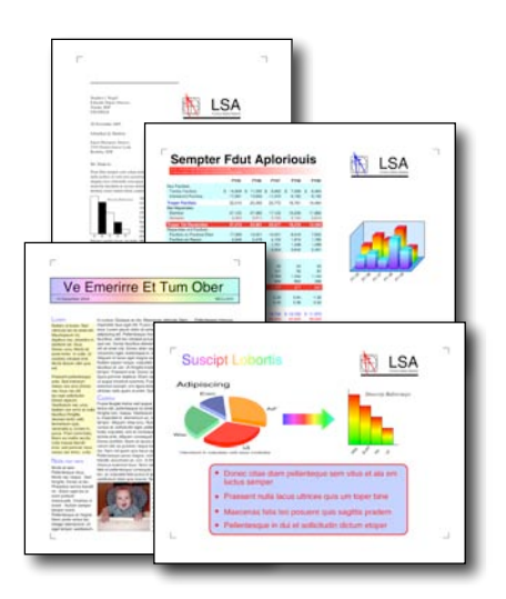
4-page Test Suite MIXED TEXT & GRAPHICS