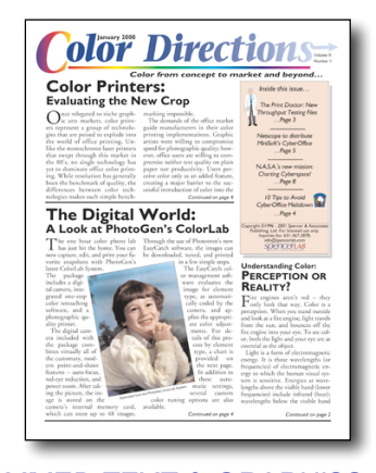
MIXED TEXT & GRAPHICS