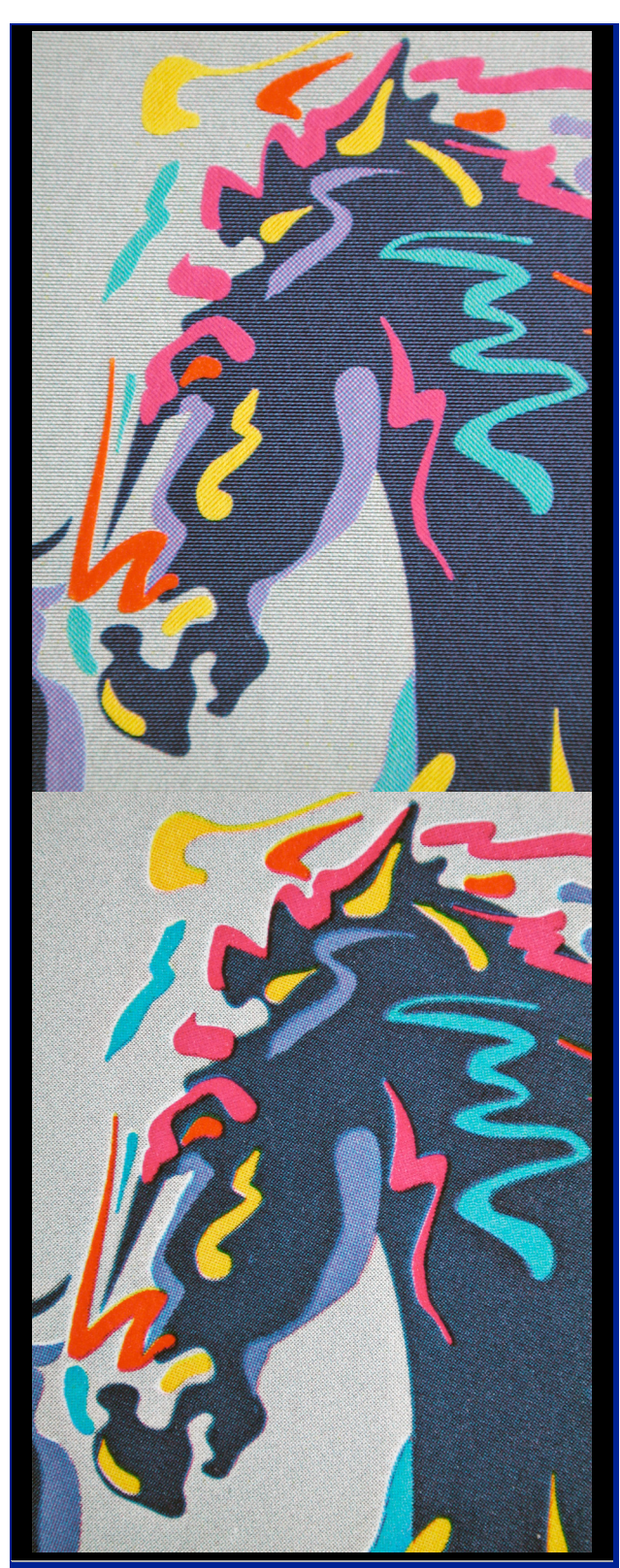
Registration and Tints: Xerox DocuColor 2240 (above) vs. Ricoh AP3800C (below)