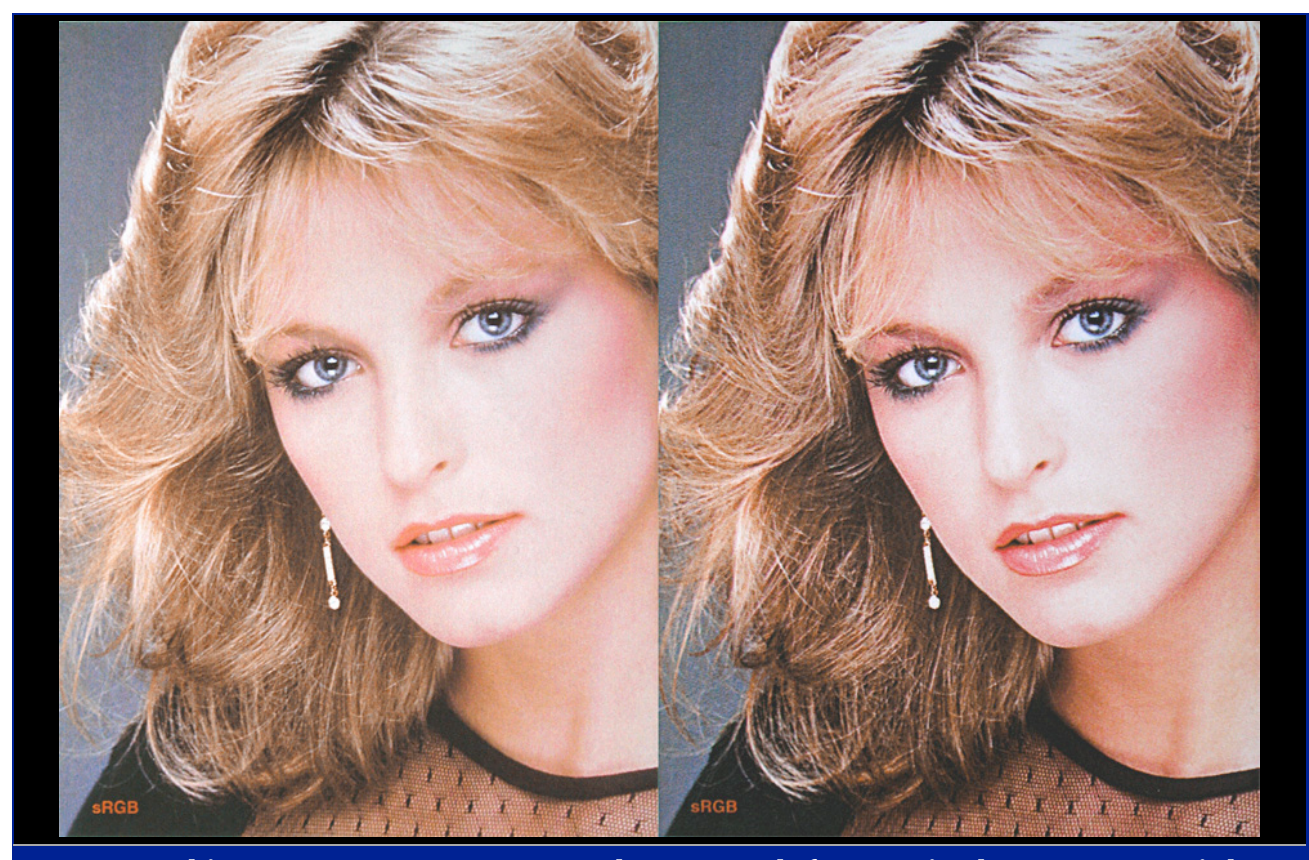
Image (Skin Tones): Xerox DocuColor 2240 (left) vs. Ricoh AP3800C (right)