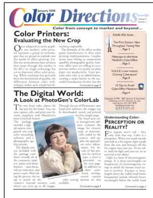
MIXED TEXT & GRAPHICS